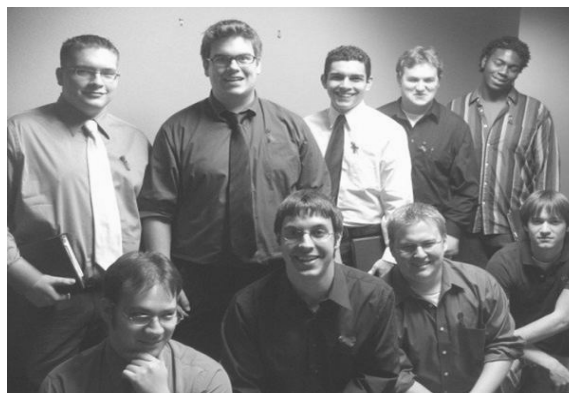
Mu Probationary Member Class